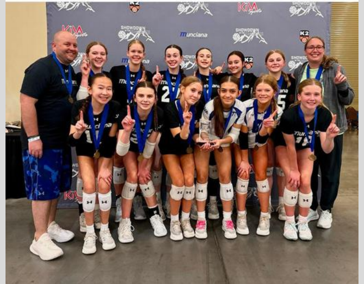
13u Stingrays 13/14 Open Champions Showdown in the Smokies