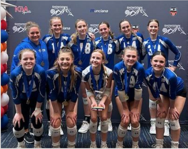
15U WARRIORS 15 CLUB WHITE CHAMPIONS SHOWDOWN IN THE SMOKIES

“Wow. It’s already May, and nationals are just around the corner. Spring brings important school activities and a final push for season ending tournaments. Every athlete has improved, but there are still new levels of performance to be achieved.